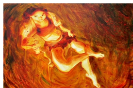
Consumed By A Red Bay 2022 acrylic on canvas 40 x 60 inches 101.6 x 152.4 cm