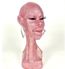
J A I 2021 ceramic, glitter 18 x 7 x 9 inches 45.7 x 17.8 x 22.9 cm