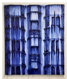
Beit Gemmayzeh 2022 acrylic, urethane, dye and quartz on digital canvas print 60 x 51 inches 152.4 x 129.5 cm