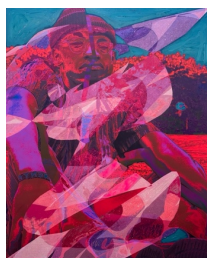
Starburst and the Forest 2022 acrylic, glitter and digital collage on canvas 61¾ x 50 inches 156.7 x 127 cm

https://www.instagram.com/julia_gould.art/