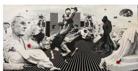
For Whom The Bell Tolls 2018 acrylic, photo, and collage on wood panel 30 x 60 inches 76.2 x 152.4 cm