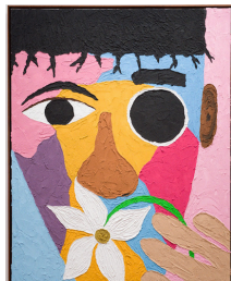
TBT 2022 acrylic and mixed media on canvas 60 x 48 inches 152.6 x 122.1 cm