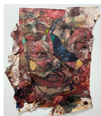
Big Good Angel #35 2022 coffee, acrylic, charcoal, coffee filter, mixed media collage on paper 58 x 50¼ inches 147.3 x 127.5 cm