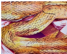
Dusk is for Lovers 2022 mixed media on panel (monotype and oil painting collage) 48¾ x 59¾ inches 122.8 x 151.9 cm