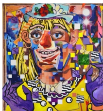
Human Sound 2022 oil, acrylic, cmyk ink on canvas 80 x 73 \frac{7}{8} inches 203.2 x 187.6 cm