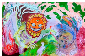
My Aunt Asked If That Was A Cloaca 2022 acrylic on canvas 40 x 60 inches 101.6 x 152.4 cm