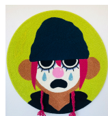
Lady Pink 2022 yarn, paper, polyfil, red glitter diameter: 29¾ inches diameter: 75.8 cm